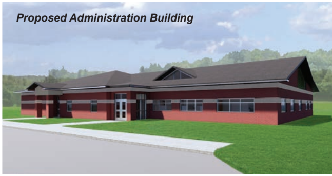
Proposed Administration Building