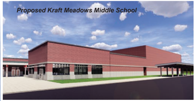
Proposed Kraft Meadows Middle School