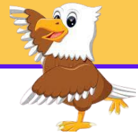
Table Talk :

Safety, Ongoing Kindness, Act Responsibly, Respect