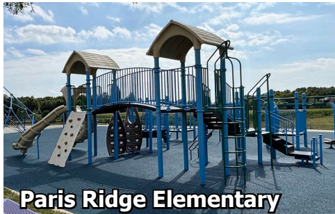
Paris Ridge Elementary