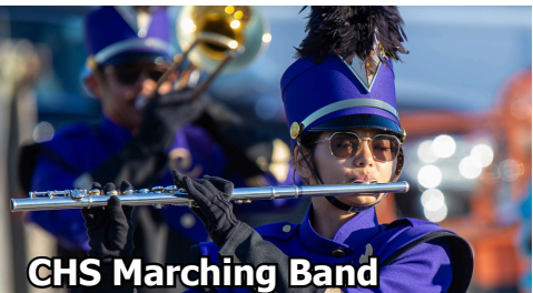
CHS Marching Band