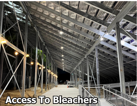
Access To Bleachers